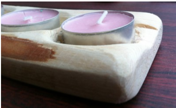
Rough,Smooth and Soft Looking,this sums up these Tealight Candle Holders and Ready provide Calmness and Tranquility,as well as a Warm Glowing affect.