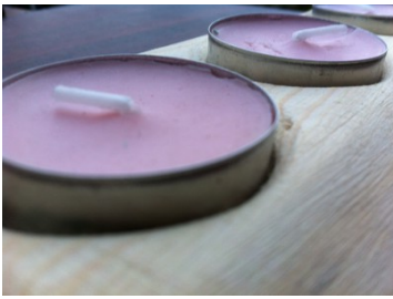
Closeup on Softness.