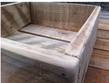
Rounded off Edges.