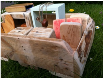
Rounded of edges and a Nice Woody Grain.

For use in the bedroom as Storage for Clothes.