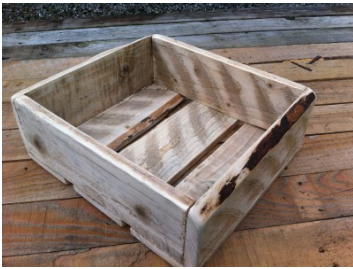
Natural Looking and Crate Looking.