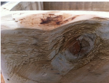
Love the Grain,Colour and Rough but Smooth.