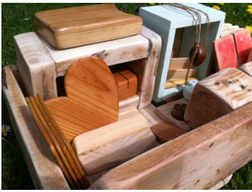
My Arts & Crafts.