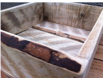
This one is very Smooth and Pleasant to touch,and you can use in the Home or Garden.

If you want something that is still Natural,and also more Rugged,then the one below might be for you.