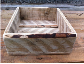
Beautiful and Rustic,Plenty of room for Storage.